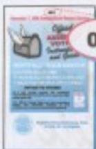
Instructions and Guide Booklet