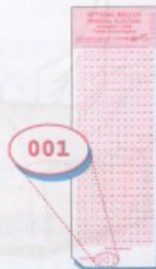
Official Ballot Card

* If they don't match, please call (562) 466-1323 or (800) 815-2666. We will immediately provide you with the correct material.