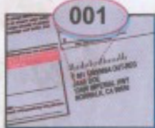
Ballot Return Envelope