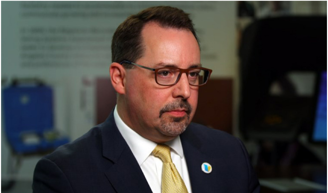
Dean Logan oversees the Los Angeles County Registrar-Recorder/County Clerk, the largest voting district in the United States.

For 2020, the nation's biggest voting district decided to grow its own voting machines and change the meaning of "Election Day." The reviews are glowing.