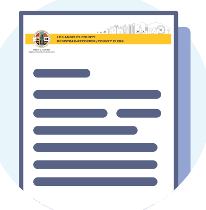
Certified election results are announced and reported within 30 days of Election Day