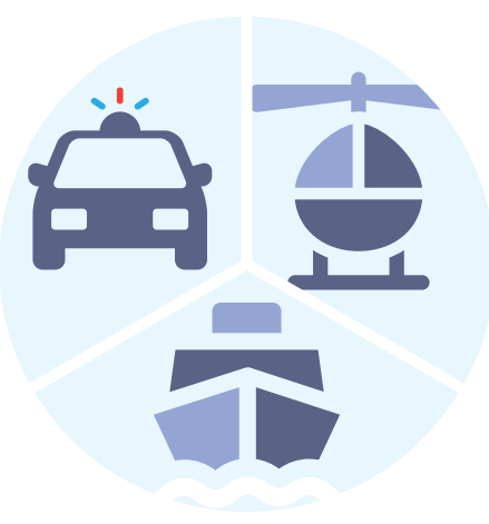
Sheriffs transport the ballots from the Check-in Center to the Tally Operation Center