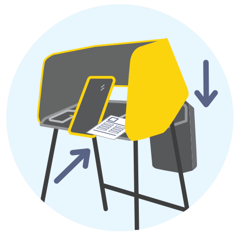
Voter casts ballot into Integrated Ballot Box attached to the Ballot Marking Device