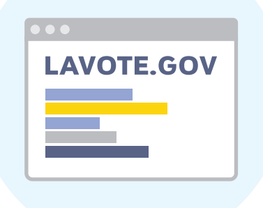
Election results are automatically updated to LAVOTE.GOV