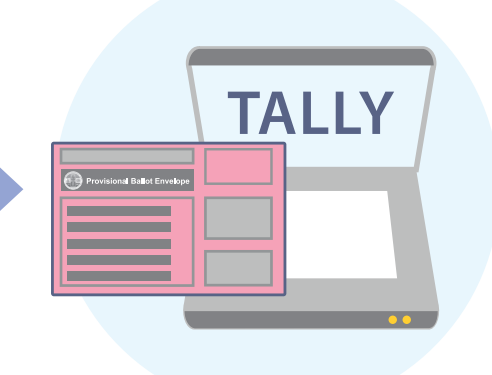
Provisional and Conditional ballots cast are processed and once verified counted in the Official Election Canvass (post-Election Day)